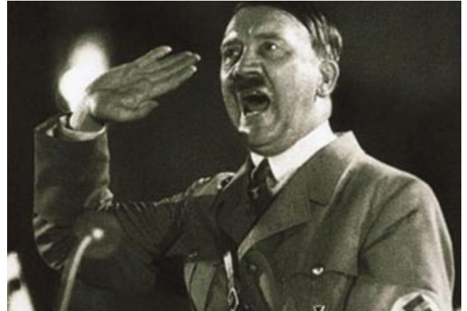
Having failed the audition for Mr. Humphries in Are You Being Served? , Hitler decided to conquer Europe instead.

The EU was founded on the very concept that countries should be reliant upon each other for their own prosperity and security. In the wreckage of World War Two, politicians such as France's Jean Monnet and Belgium's Paul Henri Spaak (Winner of the Name A Famous Belgian Competition 1945-1985, where he was finally ousted by Jean Claude Van Damme.) realised that the best way of stopping France and Germany beating the crap out of each other every 20 odd years was to put coal and steel under international control, the vital ingredients of war at the time. The theory was that the European Coal and Steel Community 3 would control coal and steel