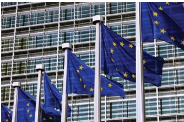
Sadly, just one rogue pair of blue underpants in the wash and all the flags were ruined.

This seems to be blindingly obvious, so blindingly obvious that we didn't do it for years, and instead had foreign leaders wondering, as Henry Kissinger said, "Who do I ring to speak to Europe?"